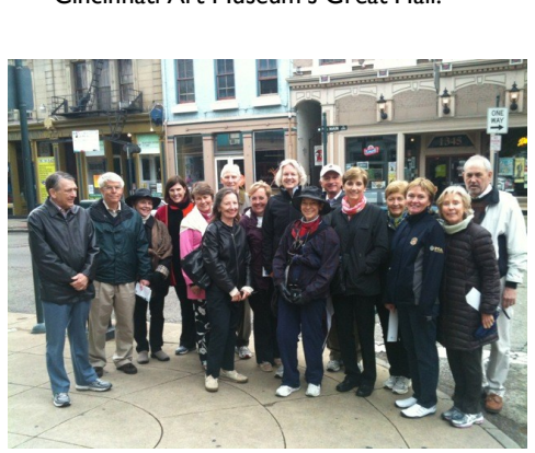
Hardy souls take an architectural walking tour of Over-the-Rhine.