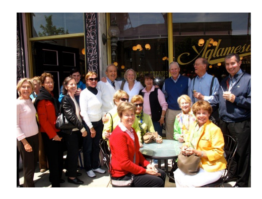
Off to University of Cincinnati Medical Center via Aglamesis Bro's, Cincinnati's original ice cream parlor.