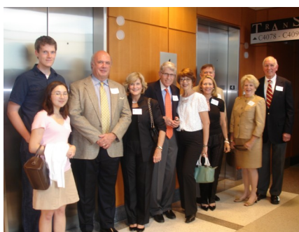
(at left) ARCS scholars, members and guests complete their tour of the institute.