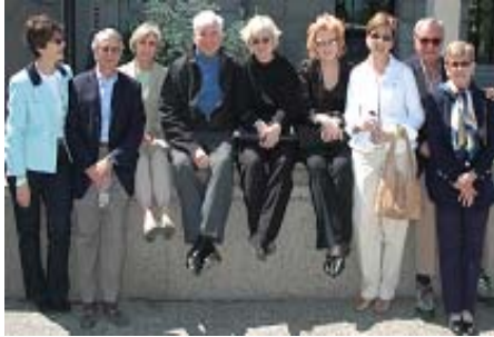
“Waiting for the bus” Where do we go from here?