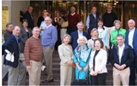
Gathering in front of the Park Hyatt Hotel