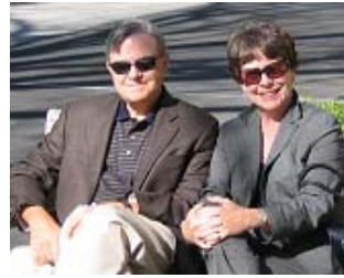
"A Relaxing Moment"