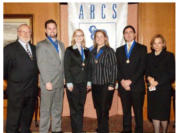
Emory scholars and Faculty