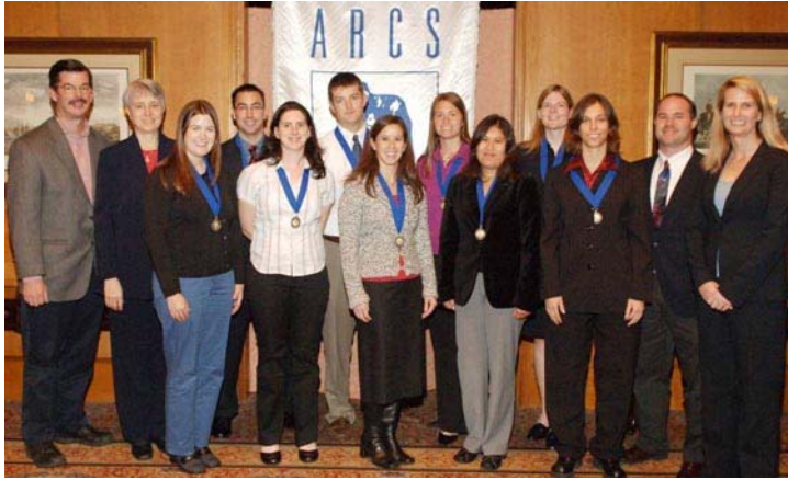
The University of Georgia Scholars and Faculty