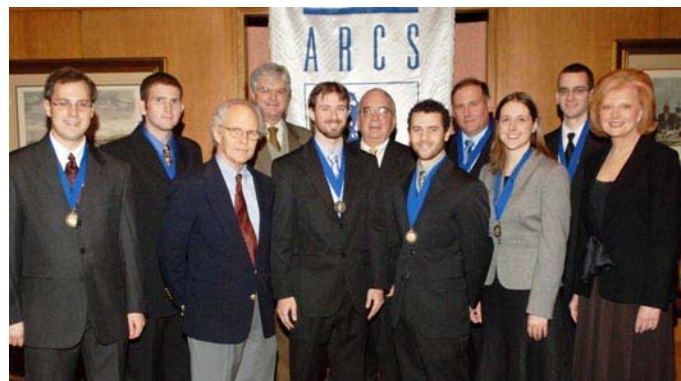
Georgia Institute of Technology Scholars and Faculty