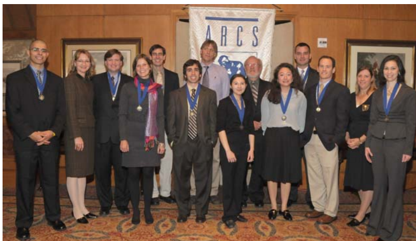
Emory University scholars and faculty