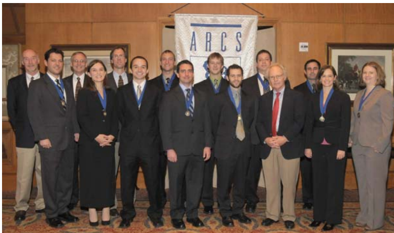
Georgia Tech scholars and professors